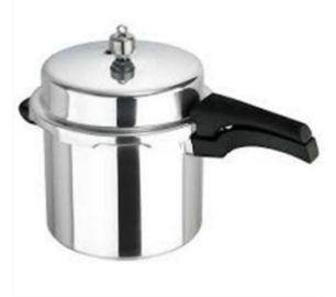
Figure 2. Small autoclaves or pressure cookers are used to sterilise equipment and materials before and after practical work.

Trained secondary science teachers and technicians follow these rules pretty well. The outcome: microbiological accidents or incidents are rare, and have not yet led to significant concerns in departments, among students and their parents, nor the wider public.