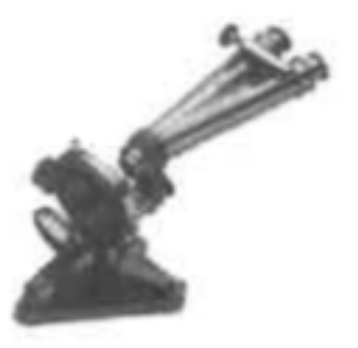
Figure 1. A late 19th century microscope similar to one used by Pasteur.

The applications of Pasteur's observational skills in practice are well illustrated by his visit to the Whitbread brewery in London in 1871. Using his own microscope, because the brewery did not possess one, he saw among the yeast an abundance of 'disease filaments' in the outflow of some fermentation vats that were suspected of showing signs of spoilage. He counted the numbers of contaminants and made drawings for the benefit of the Head Brewer, and also noted their presence in the deposit in some other casks after not finding any in the liquid above the deposit (a lesson for anyone learning to observe specimens microscopically!). On returning to the brewery a few days later, Pasteur found that a microscope had been acquired and new samples of yeast had been obtained (Figure 1).