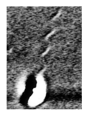
Figure 1 . Electron Micrograph of Rhodobacter sphaeroides showing the single flagellum.

depends on chemosensory signals from the environment activating receptors. This produces a signal that binds to the motor to increase CW rotation. The increased switching when heading in an unfavourable direction or decrease if the direction is favourable biases the random swimming pattern to a better environment for growth. The system needs a memory of the recent past and the ability to reset the receptors. Using this chemosensory system most bacteria can respond to a change of about 1% in the background concentrations of a wide range of stimuli, over a background range from nanomolar to millimolar.