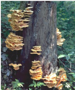
Wood decay fungi: decomposition of cellulose & lignin.