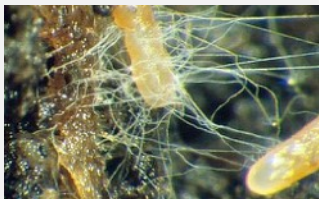
Hyphae of mycorrhizal fungi (white hairs) associated with plant roots.