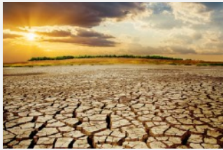
Extreme effects on land of climate change.

Fungal physiology, activities and geographical range are themselves affected by climate change, often resulting in the reduction or death of beneficial fungi in some regions, or the invasion of foreign species into new situations. This can cause diseases such as chytridiomycosis of amphibians, tar spot of maize and the human fungal infection by Candida auris .